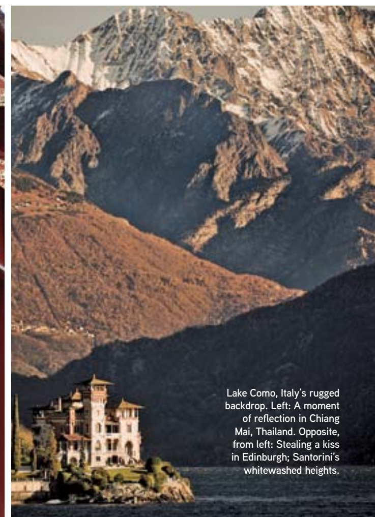
Lake Como, Italy’s rugged backdrop. Left: A moment of reflection in Chiang Mai, Thailand. Opposite, from left: Stealing a kiss in Edinburgh; Santorini’s whitewashed heights.