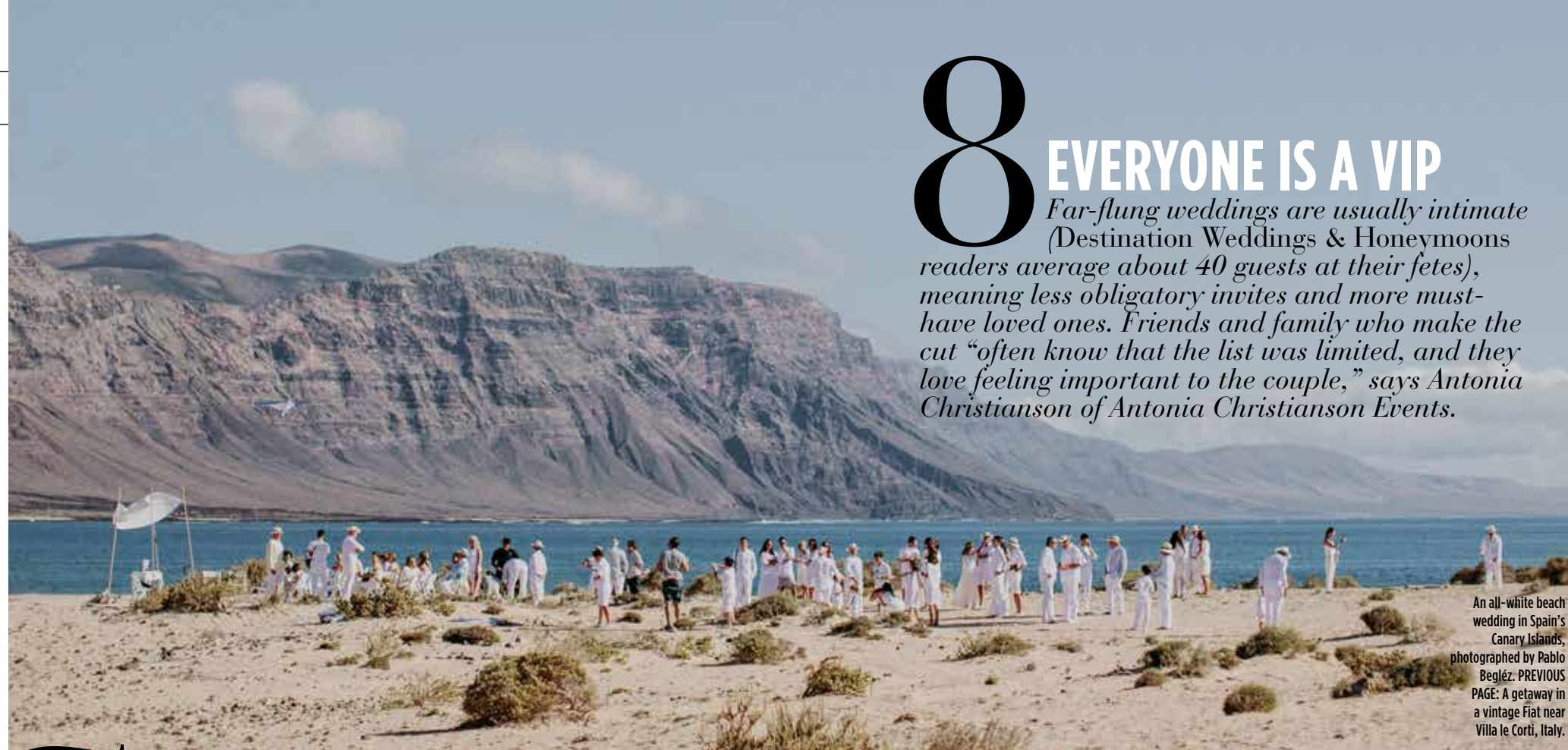
An all-white beach wedding in Spain's Canary Islands. PREVIOUS PAGE: A getaway in a vintage Fiat near Villa le Corti, Italy.

Caftans? Saris? Shorts? Anything goes. Black tie still has its place at, say, a villa in Venice, Italy ( a la Clooney), but even dressy duds can be relaxed. Think bridesmaids in floral maxi dresses and sandals in the Caribbean, with sport coats sans tie for the guys.